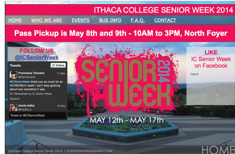
Website Home Page