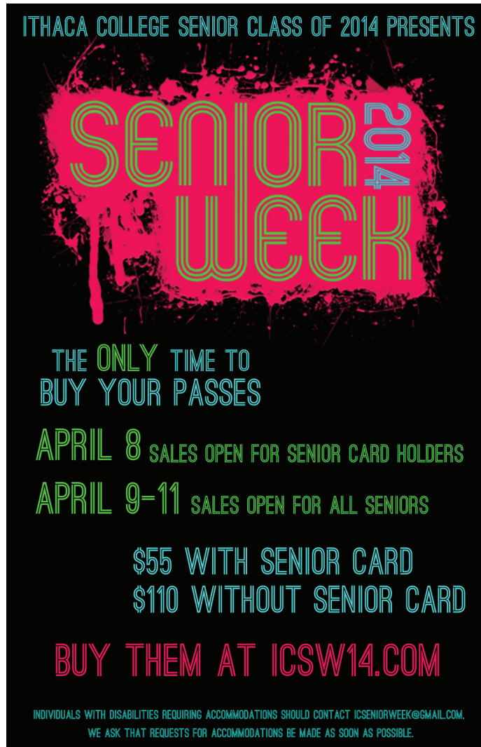
Announcement poster: Printed 8.5" x 11" Posted on bulletin board across campus