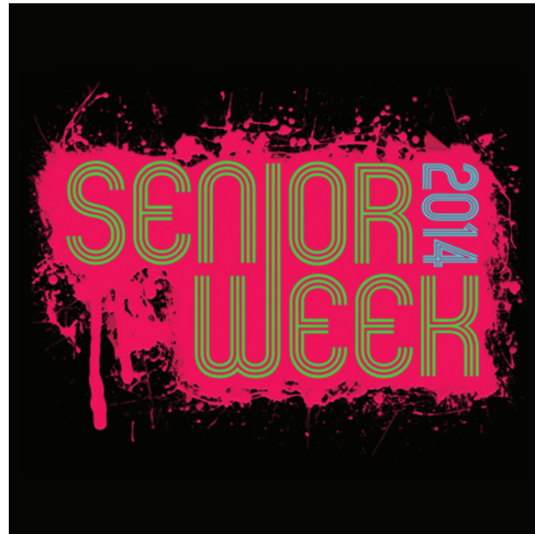
Social Media Profile Picture